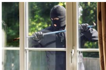
Property Protection Seminar

Registration by phone required: 972-769- 4234