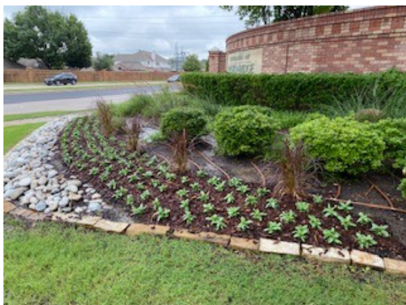
Our updated entrance on Browning!!